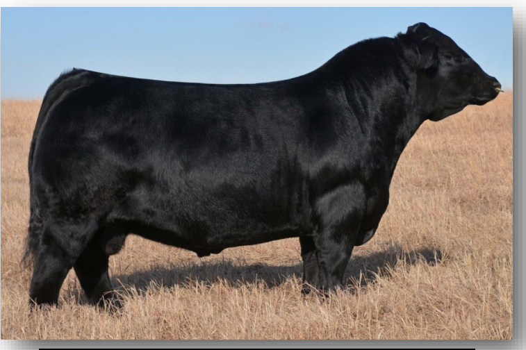
BPS Structure 308A (2756409) He is super sound, hits the ground on a large foot, deep sided & moderate in this overall frame size. CED 8 BW 3 WW 74 YW 113 M 18