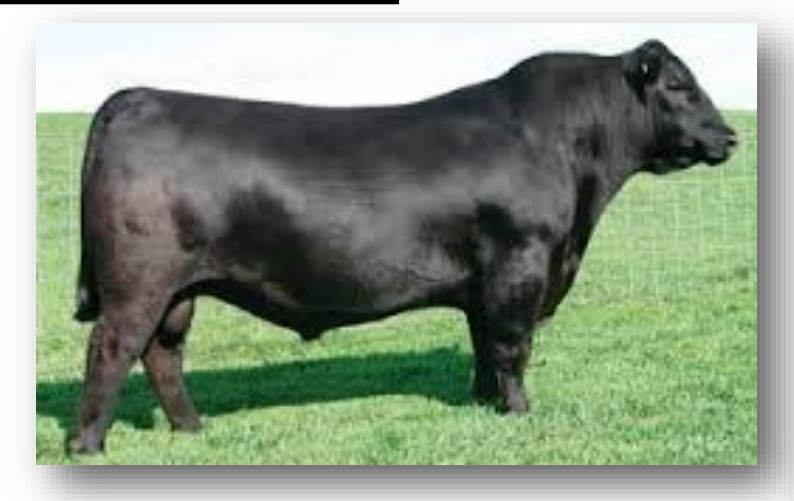
SAV Bismarck 5682 (AAA-15109865) One of the top sires in the Angus Association. CED 12 BW 0 WW 53 YW 88 M 20