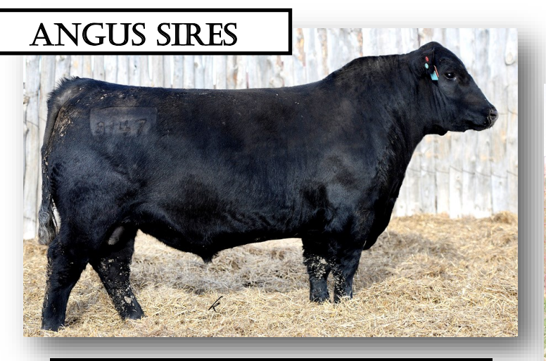
Sutphin's Rito 703 8147 (AAA-17814183) The highlight bloodline of Sutphin Sales for years. CED 3 BW 2.9 WW 36 YW 65 M 18