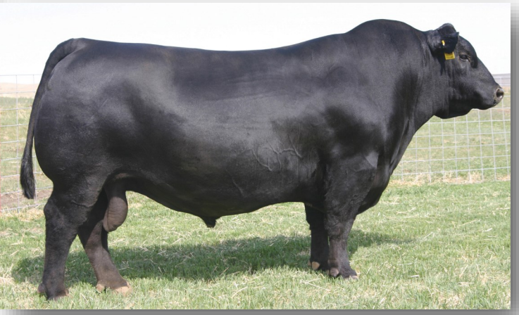
SAV Net Worth (AAA-1473924)

A superior bull that has proven himself to be one of the leaders in the Angus Breed. For maternal mass& volume.