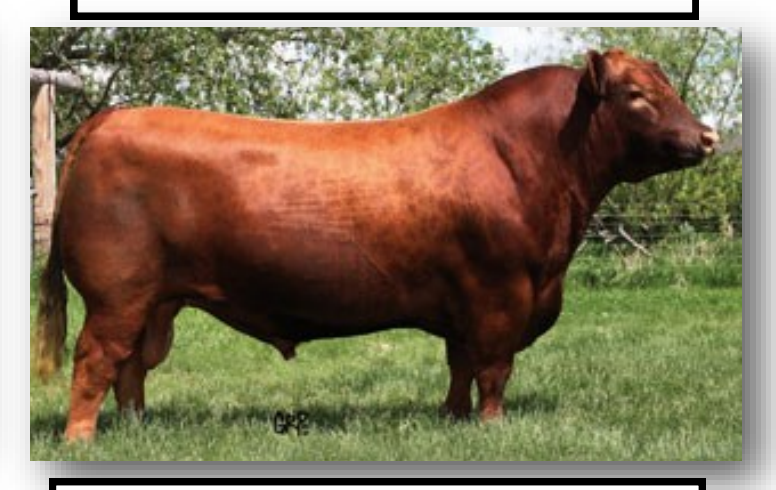
Red Six Mile Sakic 832S (1160318)

Widely recognized for siring beautiful phenotype & outstanding daughters.