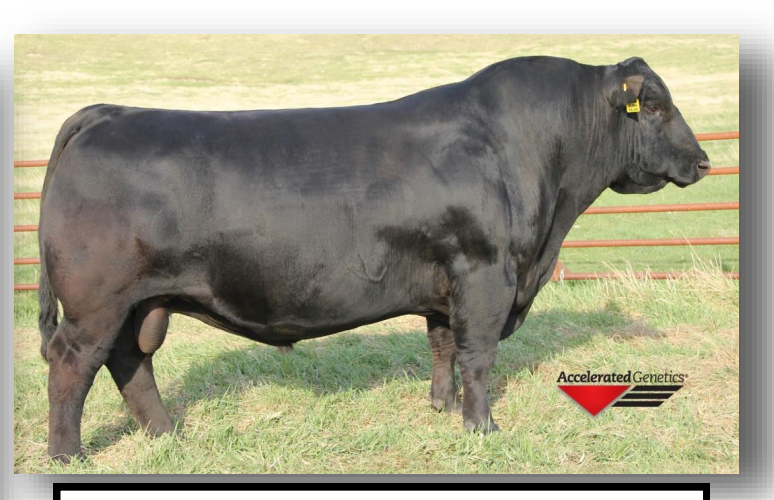
SAV Platinum 0010 (AAA-16687592) Sire to KLA Palladium 398

Platinum is a long-bodied, deep-ribbed bull. He is a curve bending sire that offers calving ease with exceptional growth & maternal traits. Lot 446,