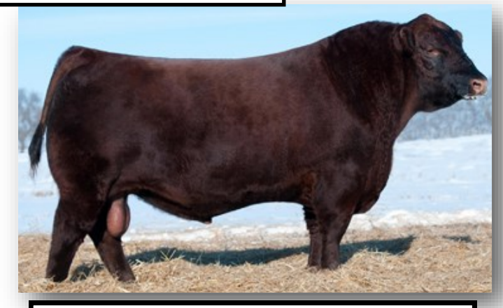
Red Cockburn Ribeye grand sire of Red JCC Advance 33A (1753278)

Will add depth of rib & weight to your calves.