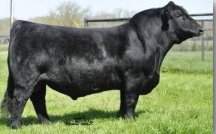
Sire of B/C Thunderstruck 7174E (3367336)

Thunderstruck is unique in the combination of his thickness & muscle shame in a smooth package.