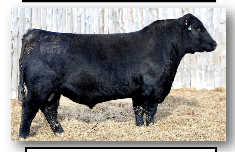
Sutphin's Rito 703 8147 (AAA-17814183) The highlight bloodline of Sutphin Sales for years. CED 3 BW 2.9 WW 36 YW 65 M 18