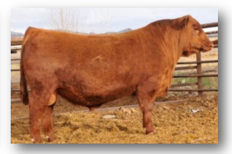
5L Out In Front 1701-457B Sire of 5L Out in Front 5084-60D (3565084) CED 8 BW –2.0 WW 67 YW 100 M 18