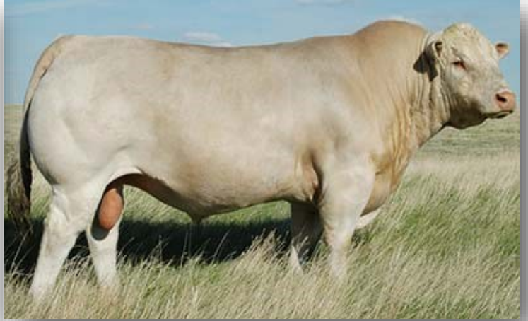
Lt Ledger 0332 P (M791626) Ledger is being widely used across the country. CED 7.5 BW -0.9 WW 33 YW 71 M 3