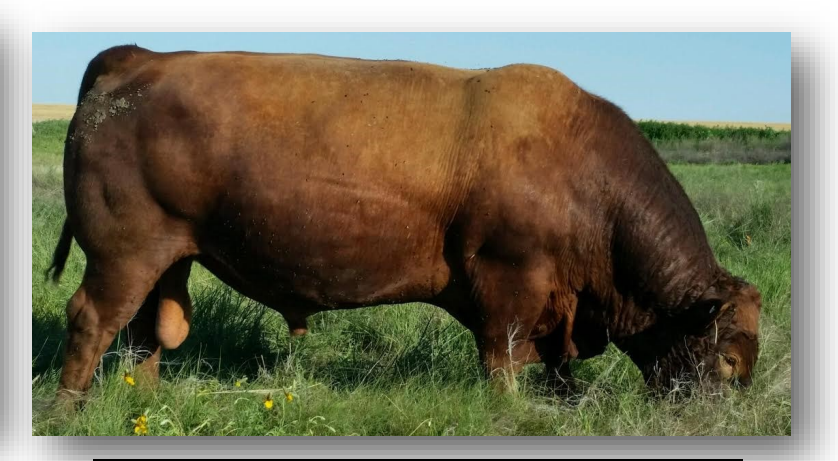
Leachman Deniro A090x (1371233)

Sire to Sutphin Deniro 196W & 108z Expressive muscle, deep rib & proven heifer maker.