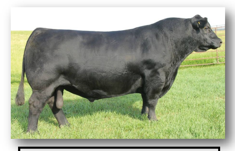
SAV Harvestor 0338 grandsire of KLA Instinct 9145 (AAA-16879074) Harvestor is a $275,000 true breed changer and performance powerhouse.