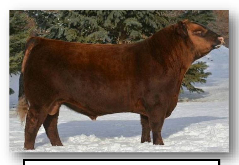
Damar Trump C512 sire of Blair's Trump 321F (Canadian) Trump is a truly unique herd sire with amazing phenotype.