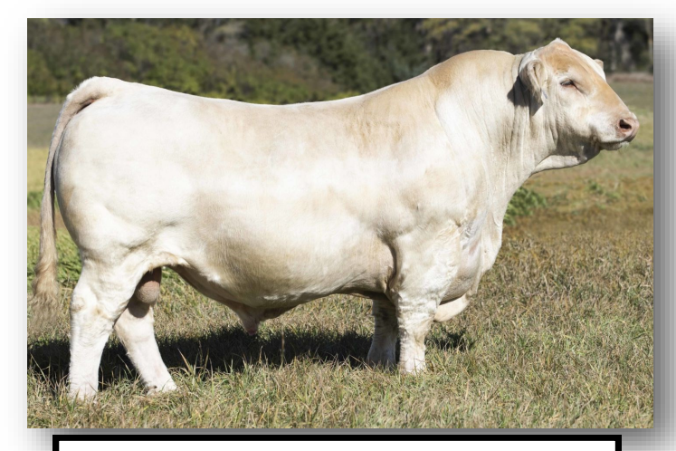
Lock N Load 243P (M836295) His outstanding numbers will impress. He ranks top in several Epds rankings. CED 7.6 BW 0.4 WW 75 YW 141 M 21