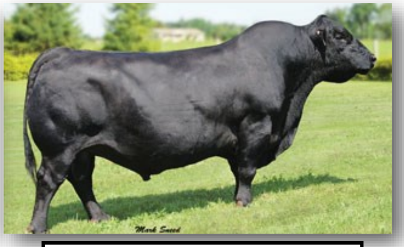
SAV Final Answer 0035 (AAA-13592905) Final Answer has proven himself for several decades for light BW & making phenomenal females.