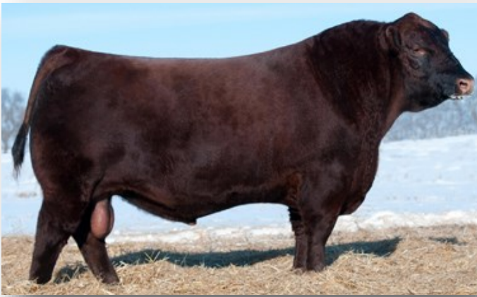
Red Cockburn Ribeye grand sire of Red JCC Advance 33A (1753278) Will add depth of rib & weight to your calves. CED 13 BW -0.8 WW 39 YW 51 M 15