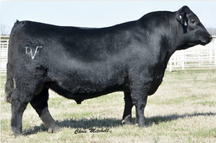
Deer Valley Unique 5635 (18429666) sire to OA Unique 116 (20144091)

One of the most widely used & highly respected bulls of the Angus breed. CED 13 BW -0.7 WW 59 YW 109 M 43