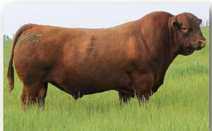
Pie Cinch 4126 sire of Crump Cinch 9343 (4099486) He produces stout & powerful sons. His progeny are deep bodied with added muscle shape. CED 14 BW -2.4 WW 75 YW 122 M 30