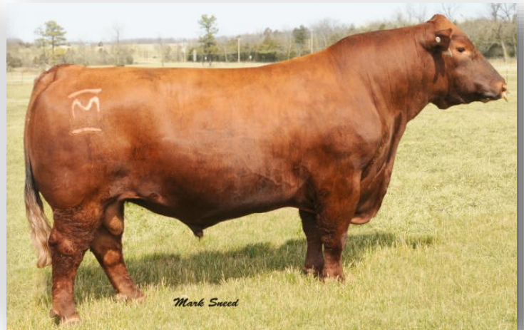
Sire of Mushrush Impressive LN U217 (1295151) One of the top bulls of the 2010 Mushrush Sale. He is a calving ease deluxe bull. CED 16 BW -2.9 WW 69 YW 115 M 16