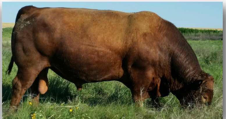
Leachman Deniro A090x (1371233)

Sire to Sutphin Deniro 196W & 108z Expressive muscle, deep rib & proven heifer maker.