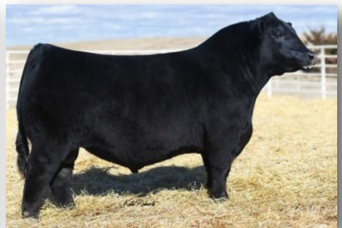
KR Quality 8525 (19219149) sire to FAR Quality 2098 (20477691)

One of a kind in terms of structure, sheer mass, dimension & depth of body. CED 10 BW -1.3 WW 64 YW 117 M 28