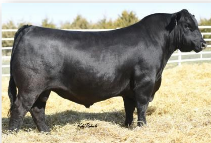
Freys Undisputed (19485292) Sire to FAR Undisputed 2148 (20477715)

Power, Perfection & performance! A true game changing sire. CED 9 BW -0.3 WW 58 YW 115 M 28