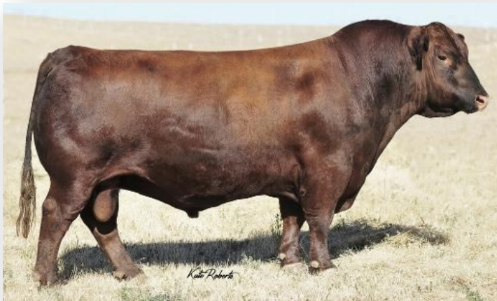
Andras Fusion R236 (1506931) Proven calving ease option in the ABS lineup. He is a wide bodied, deep ribbed & heavy muscled bull. CED 15 BW -2.8 WW 53 YW 93 M 24