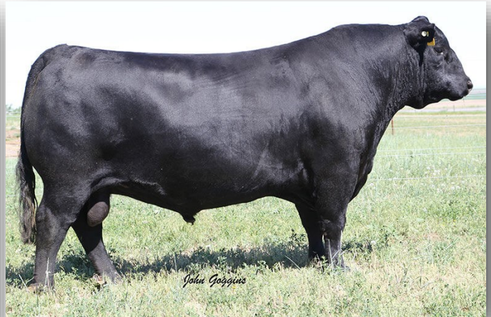
Connealy Consensus 7229 grandsire to KB Developer 9616 2613 (20742401)

Will add frame, bone, length & capacity to his calf crop. An absolute powerhouse. CED 0 BW 2.6 WW 77 YW 128 M 21