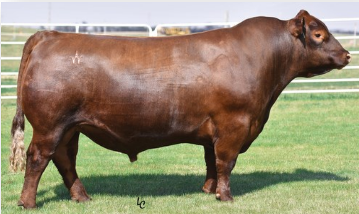
Andras New Direction R240 sire of Sutphin's New Direction 443Z High Performance, with excellent phenotype CED 14 BW -2.1 WW 64 YW 110 M 19