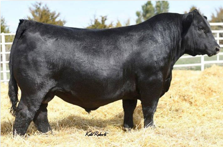
Evenson Southern Charm 086 sire of FAR Southern Charm 2273 (20477738)

Will add frame, bone, length & capacity to his calf crop. An absolute powerhouse. CED 0 BW 2.6 WW 77 YW 128 M 21