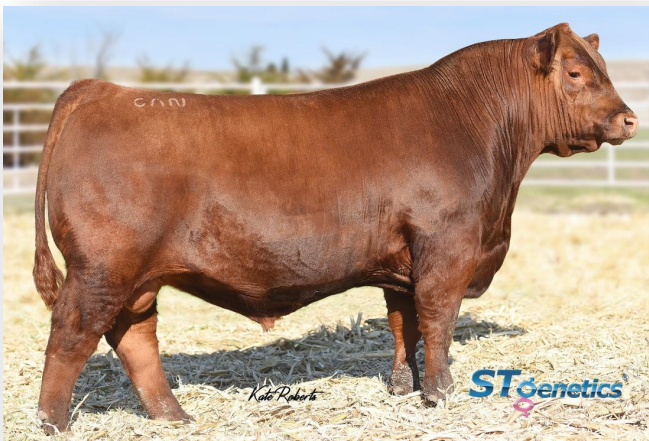
Red U2 Dominion (4098772)

An outcross sire who continues to stamp his progeny with phenotype, foot quality & stoutness .