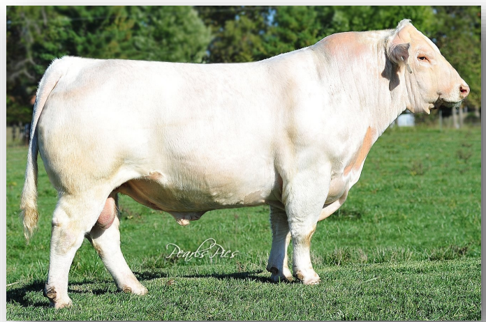
Cooley Royce 1107T39 (M745957) Grandsire to Schurrtop M 2569 9096 P

His offspring are deep bodied, heavy structured & top brood cows.