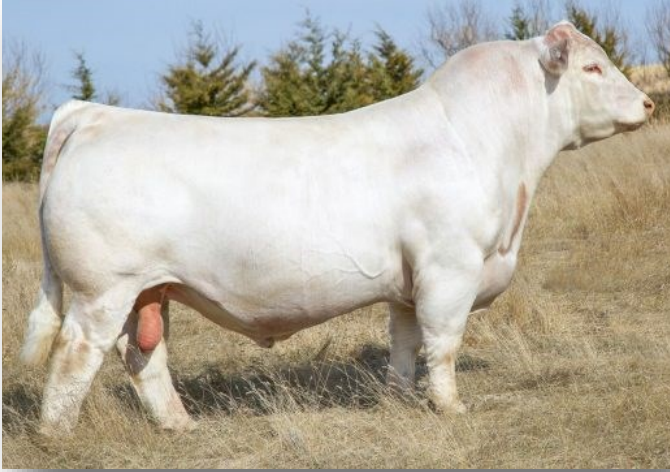
TR CAG Carbon Copy 7630E ET (EM896198) sire of RBM Carbon Copy K 05 (EM973856)

Calving ease sire that has a balanced EPD & currently ranks in the top 25% or better for six EPDs traits.