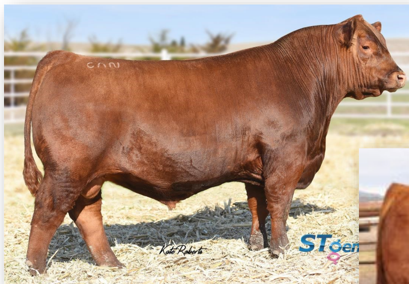
Red U2 Dominion (4098772) An outcross sire who continues to stamp his progeny with phenotype, foot quality & stoutness . CED 8 BW 1.8 WW 71 YW 123 M 23