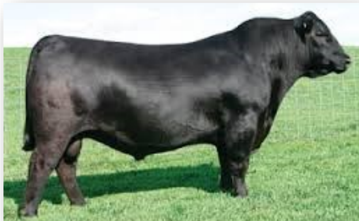
SAV Bismarck 5682 (AAA-15109865)

One of the top sires in the Angus Association.