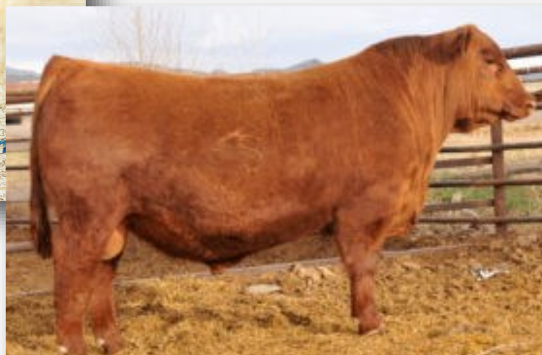
5L Out In Front 1701-457B Sire of 5L Out in Front 5084-60D (3565084) CED 8 BW -2.0 WW 67 YW 100 M 18