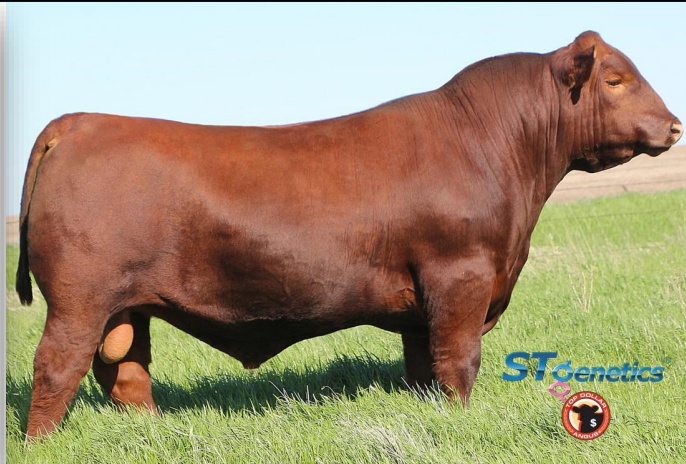
Pie Up Front 508 (3503354) A stout, complete & durable. Offers a dependable pedigree with performance excellence. CED 11 BW -0.1 WW 67 YW 109 M 27