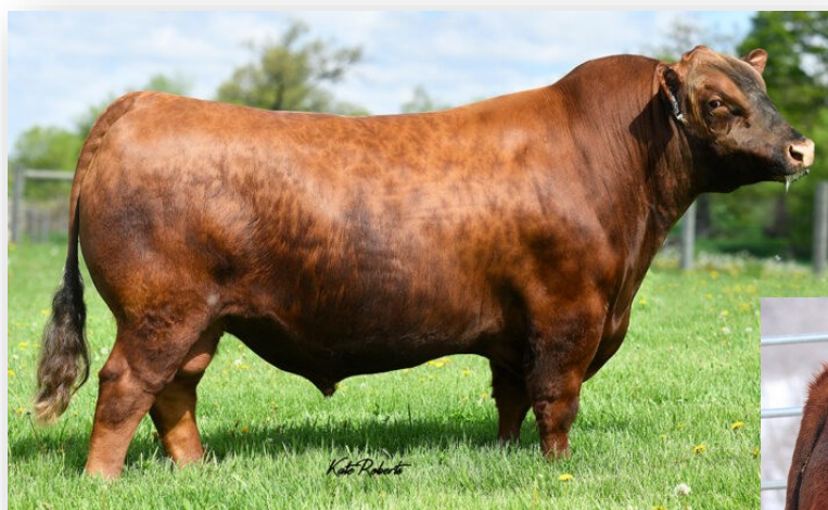
9 Mile Franchise 6305 Brother to C-Bar Franchise 8135F (4045174) Impressive phenotype with low BW & high CED. CED 15 BW -4.0 WW 64 YW 102 M 24