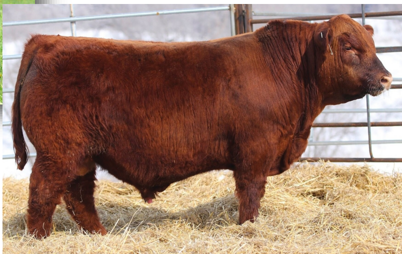
Nio Santana 8019 (3969168) he is a bull that dominated the competition & is put together in a perfect fashion. CED 11 BW -0.6 WW 52 YW 74 M 16