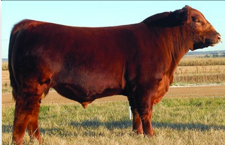
Hamley sire of TC 3 Aces Hamley 2605 (3491394) Phenotypically flawless, Hamley will add pounds & muscle dimension in a sound & attractive package. CED 15 BW -1.3 WW 49 YW 69 M 23