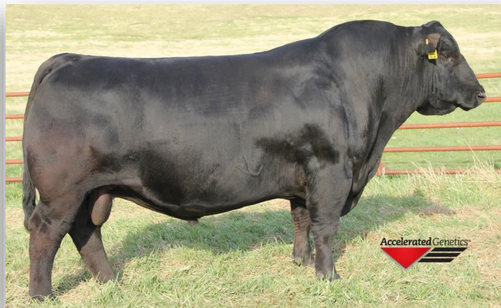
SAV Platinum 0010 (AAA-16687592)